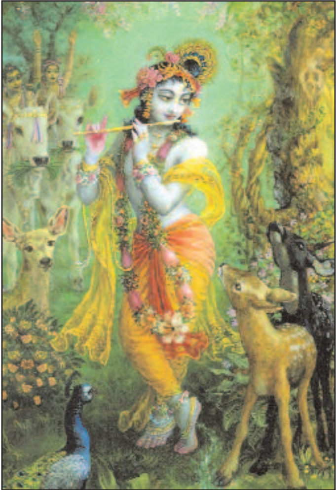
Kṛṣṇa, the self-effulgent embodiment of love and eternal bliss.